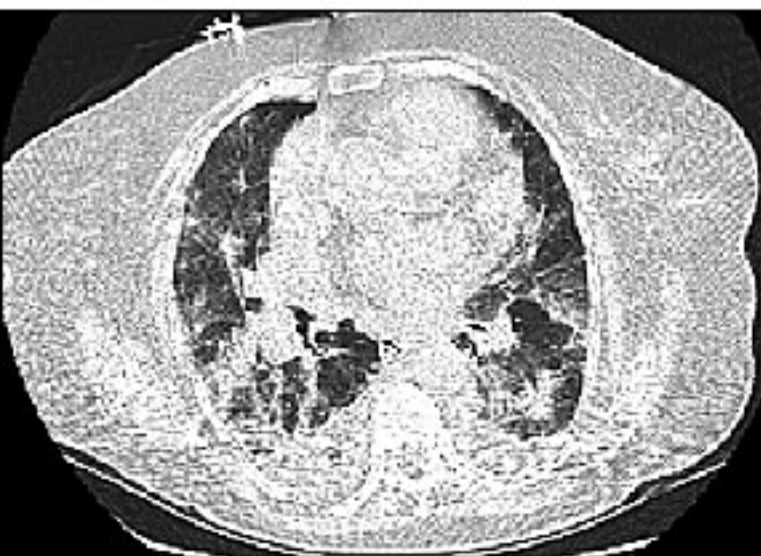
Figure 2—Chest CT scan demonstrates extensive ground-glass opacities and airspace consolidation of both lungs.